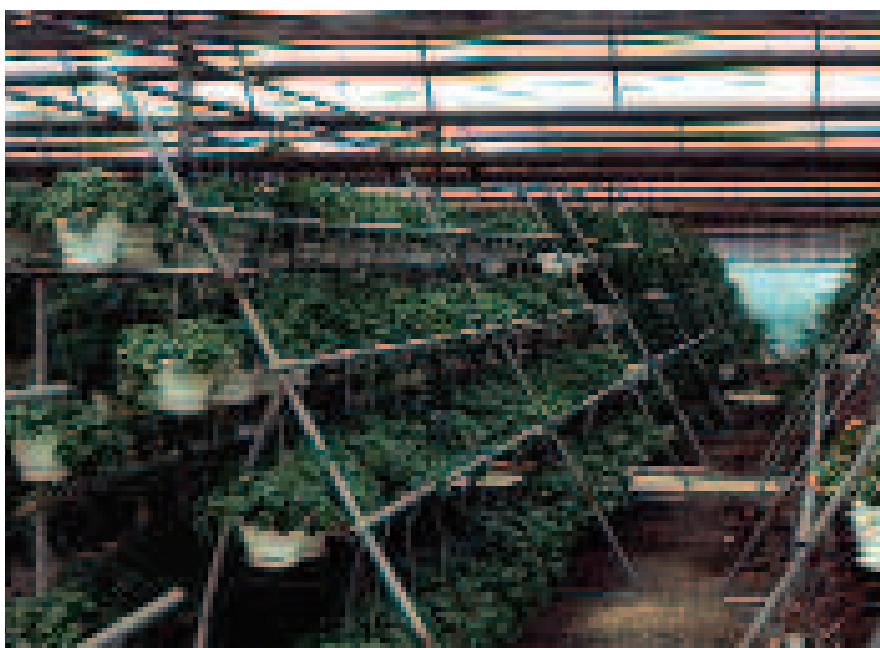
Top: Movable benches eliminate all but one work aisle. Middle: Plant production area can be doubled with roll-out benches. Bottom: Pipe frame racks work well for hanging baskets and shade-loving plants.