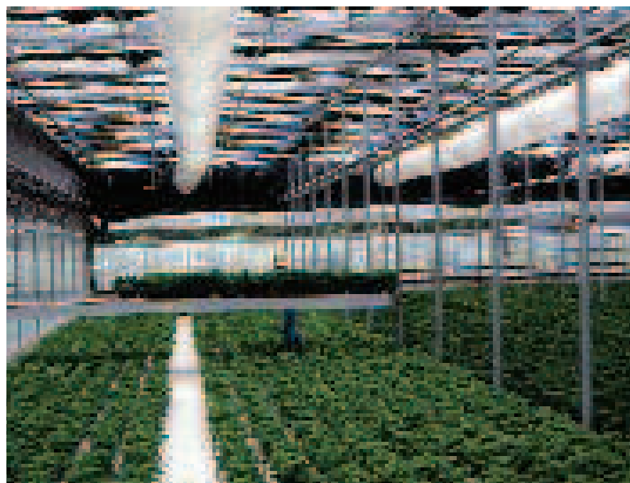
Top: High space efficiency can be achieved with floor production. Root zone heat and boom irrigation can improve plant quality. Bottom: A gantry can speed plant handling with flood floor production.