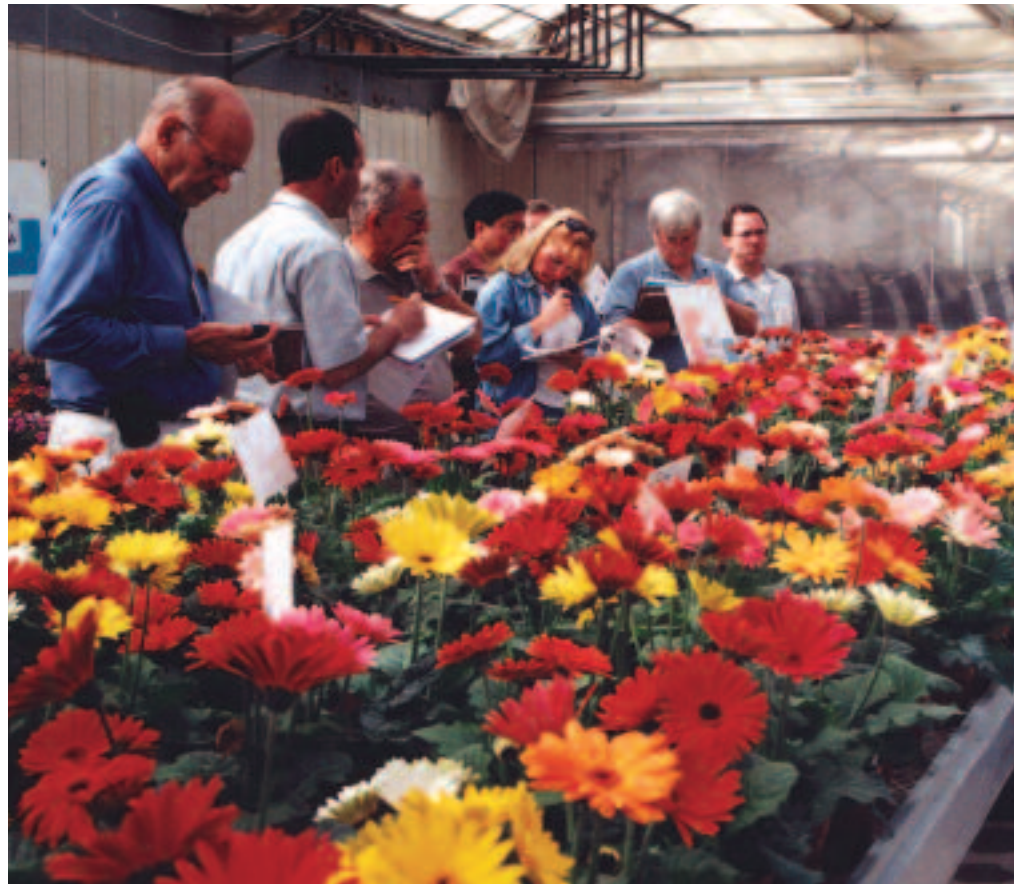
In addition to seeing all the new varieties, tour attendees received results from a grower trial of gerbera at Pacific Plug and Liner.

C an you imagine anything more fun than riding around California with a busload of garden center owners during the beginning of their spring rush? We couldn't either, so with a lot of planning, a little convincing and cell phones in every hand, Lawn & Garden Retailer (GPN's sister publication) and the Garden Centers of America (GCA) launched the first annual Retail Pack Trial Tour this past March.