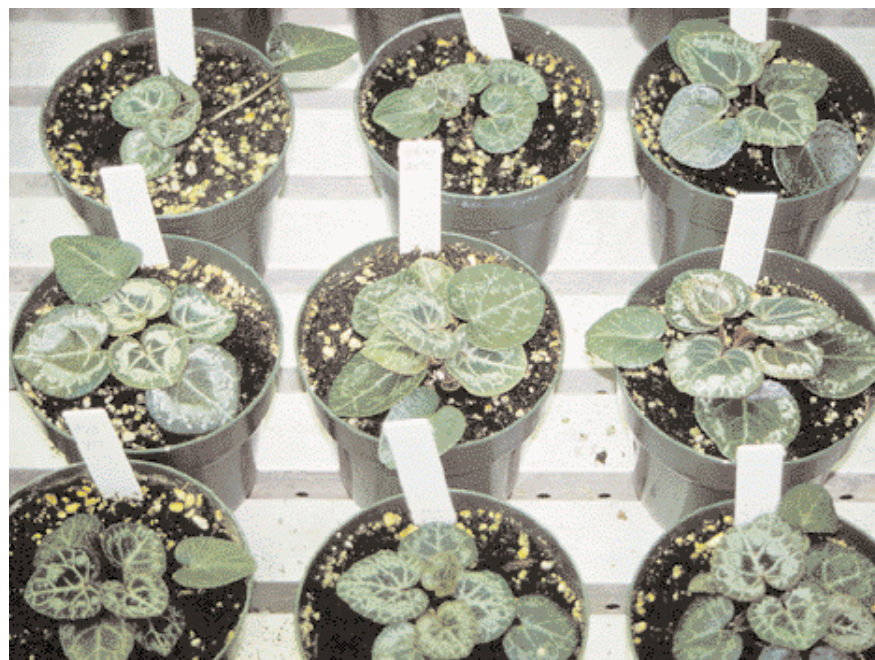
Cyclamen in early stages of development.

flowering can be predicted 29 days after color appearance with a change from 60° F to 68° F after 13 days. Cyclamen grown with nine initial weeks at 68° F, flowered 30 days after color with 18 days at 68° F and 12 days at 60° F.