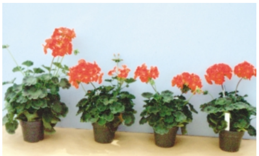
Top: 'Ringo 2000 Red' geraniums subirrigated 11 times over four weeks with Bonzi beginning when the plants were about 2-3 inches in diameter. Bonzi solutions were diluted to a concentration of 10 percent of those applied one time. Left to right: No treatment, 0.011, 0.022 and 0.033 ppm Bonzi. Photo was taken 50 days after Bonzi treatments began; Bottom: 'Ringo 2000 Red' geraniums subirrigated once with Bonzi when plants were about 2-3 inches in diameter. Left to right: No treatment, 0.11, 0.22 and 0.33 ppm Bonzi. The photo was taken 50 days after the Bonzi treatment was made.

face applications because chemicals applied to the surface slowly leach down to the root zone while PGRs applied by subirrigation get to the root zone faster.